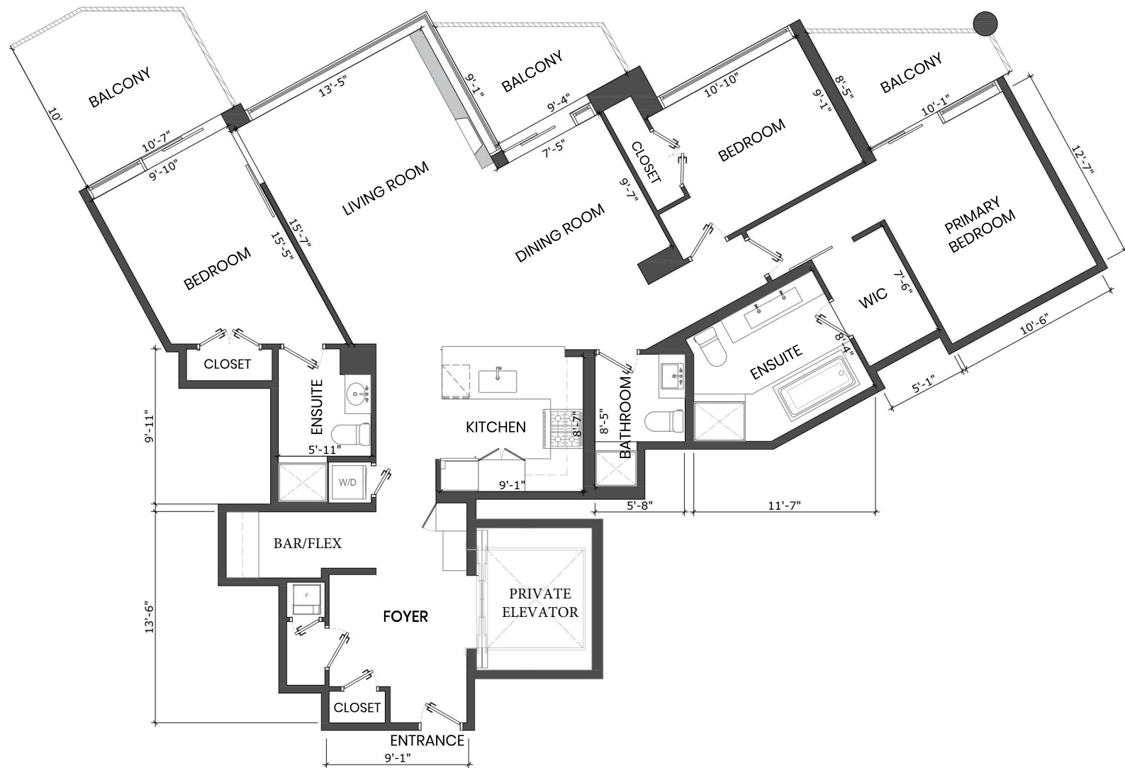
MAIN FLOOR PLAN Ceiling Height: 9'-0"